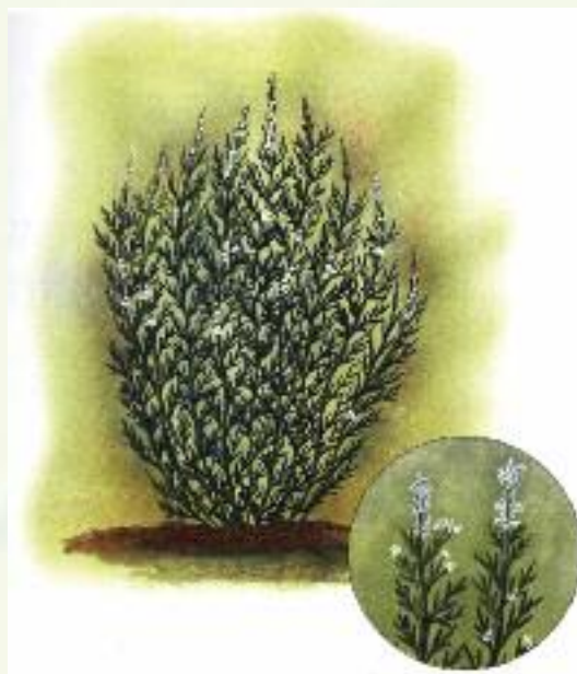
Rosemary ( Rosmarinus officinalis ).

Rosemary extract from the dried leaves of rosemary ( Rosmarinus officinalis ) contains Ursolic acid, Carnosic acid and Rosmarinic Acid. Rosemary extract's unique cascading power revolves around carnosic acid. After this powerful molecule has extracted a free radical, it changes its structure and becomes carnosol. Carnosol also extracts a free radical to become rosmanol. Rosmanol continues the free radical scavenging until galdosol is created and further continues