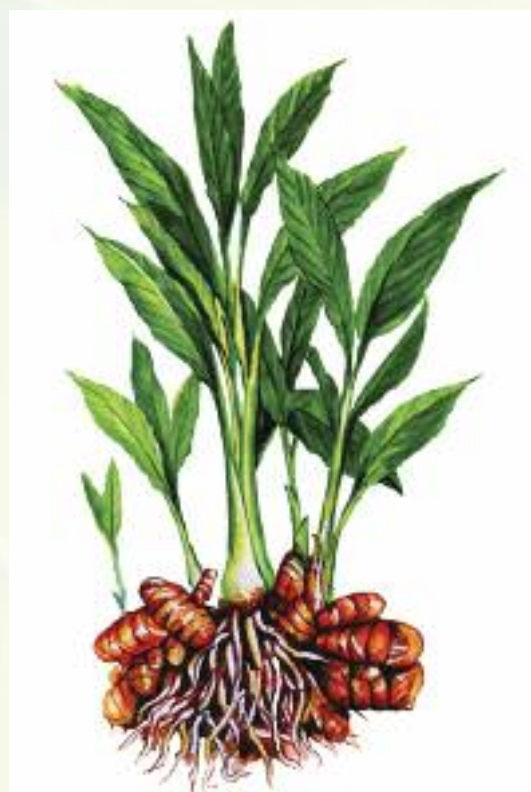
Turmeric ( Curcuma longa ).

Grape seed extract lowered postprandial (after meal) oxidative stress in persons eating a meal rich in fats compared to persons who ate identical meals without taking the extract. Hyperlipidemia, or higher blood lipid levels, is a well-studied risk factor for atherosclerosis caused by after-meal spikes of blood fat. This type of oxidative stress is, in part, caused by increased LDL oxidation and was minimized by grape seed extract supplementation (38).