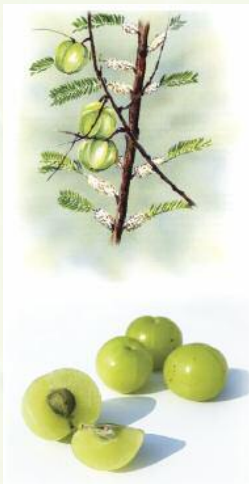
Amla (Emblica officinalis).

Higher levels of protein oxidative damage are found in the plasma of type 2 diabetics compared to healthy controls, and data suggests that reduced free radical scavenging in the plasma of diabetics makes them more susceptible to protein oxidation. The greatest difference seen in diabetics vs. non-diabetics is that diabetics have higher serum levels of advanced oxidation protein products (AOPP). This form of severe protein oxidation is higher in long-term diabetics (ten years or more), non-diabetic obese patients and in patients with blood lipid disorders (20-22). Diabetic patients who have poor glycemic control have higher serum levels of protein carbonyls and advanced oxidation protein products than diabetics who have good glycemic control (23).